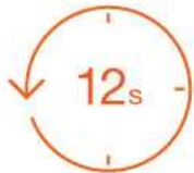
12 Seconds Cut-off