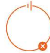
Short Circuit Protection