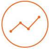
Puff Monitoring System