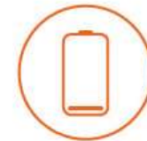
Over discharge protection