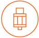
Intelligent Atomizer Recognition

Mag adopts high-definition TFT screen. It can show you specific vape data in a clear way, such as VW/TC MODE, vaping effect, voltage, battery life, resistance value etc.